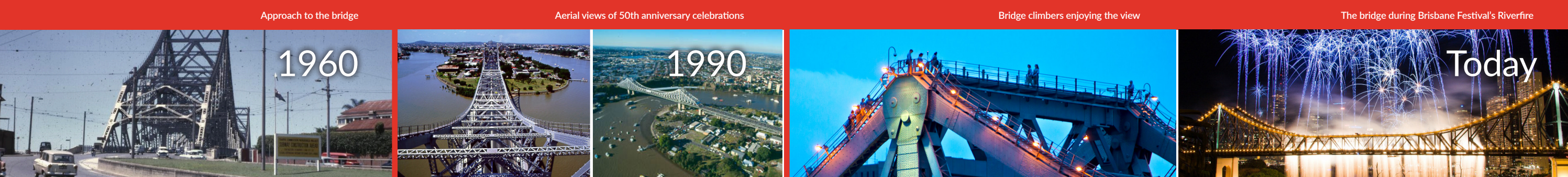
Approach to the bridge

On 21 April 1988, an Institution of Engineers Australia Historic Engineering Marker was unveiled on the main southern pier in Captain Burke Park to commemorate the bridge as a masterpiece of Australian engineering. Today, locals and tourists climb the bridge to learn about the bridge's heritage and take in the breathtaking Brisbane River views.